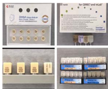
Figure 2: Examples of In Lab and chairside CAD-CAM materials.

but a high Weibull modulus (16,10) , according to the manufacturer.