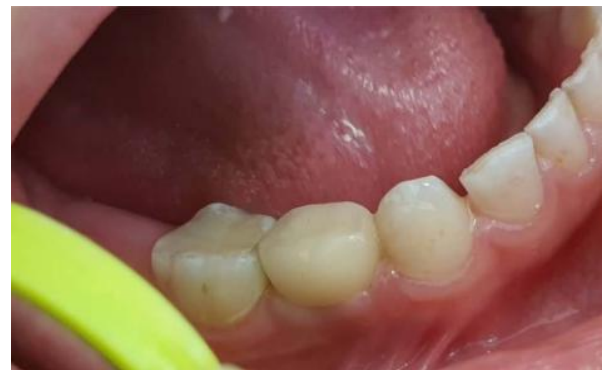
Fig. 3. Photograph of the tooth after cementation

The crown was first tried-in to assess its adaptation. A thin layer of Z-Prime (Z-Prime TM Plus, Bisco, USA) was applied on the zirconia crown's internal surface and allowed to dry for 3-5 minutes. Evidence shows that products containing 10-methacryloyloxydecyl dihydrogen phosphate (10-MDP) such as Z-Prime significantly increase the shear bond strength of zirconia crowns [11]. TheraCem dual-cure, self-etch cement (BISCO, Schaumburg, IL, USA) was used to cement the crown. The tooth was rinsed and dried. The cement was applied to the internal crown surface, and the crown was seated on the tooth. After 2-3 seconds, the buccal and lingual margins were light-cured (Flashlite 2.0, Medical Expo, USA), and excess cement was removed (Figure 3). The entire crown was then light-cured for 20-30 seconds. Since the selected cement was dual-cure, occlusion was rechecked after cementation [12].