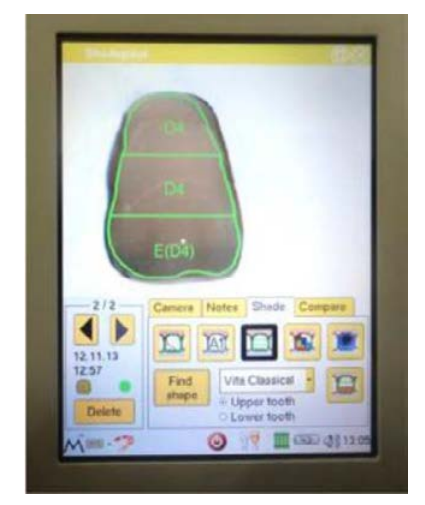
Figure 5: Tooth color in incisalbody-cervical areas

The research project was performed by immersing A4, B4, C4, and D4 color samples in glutaraldehyde and distilled water at three different times (24, 48, and 72 hours) and colorimetry at four different times (0, 24, 48, and 72 hours). The following results were obtained: According to the results of Table 1, it was shown that the type of solution is effective in discoloration of all the samples, regardless of the type of the color sample (P=0.006<0.05). Also, color change in glutaraldehyde solution (P=0.0001) and distilled water (P=0.0001) showed a significant difference at different times (P<0.05).