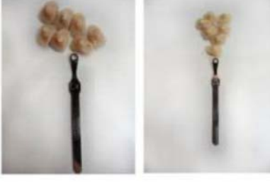
Figure 3: Preparation of the shade pilot spectrophotometer to take photos of the samples