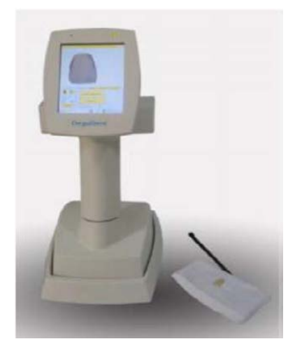
Figure 4: Photo on the spectrophotometer's monitor