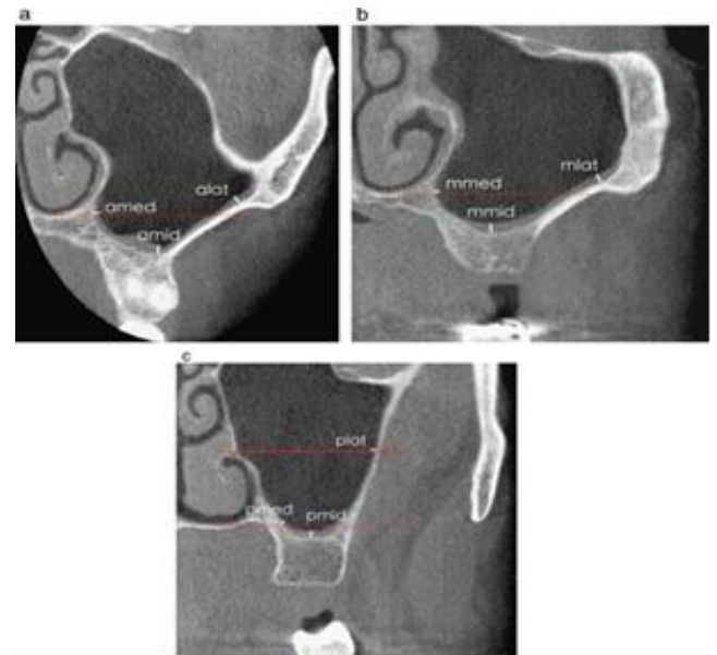
Figure 2. Anatomical landmarks for measurement of mucosal thickness on coronal CBCT sections in the anterior (a), middle (b) and posterior (c) areas. Initiation point of zygomatic process for lateral measurements (lat), deepest point of the sinus floor on coronal CBCT sections for mid-sagittal measurement (mid), skeletal floor of the nasal cavity of the same side for medial measurement (med). Dotted red line indicates the position of skeletal floor of the nasal cavity. Continuous red line indicates the inferior nasal concha

The two groups were compared regarding the Schneiderian membrane thickness by paired t-test.