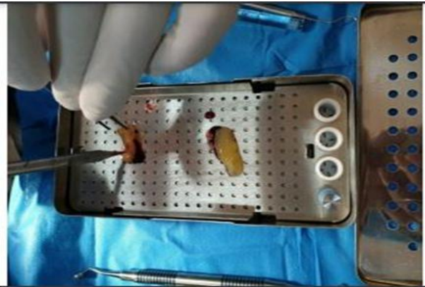
Figure 4. Weight of the cap resulted in formation of a membrane from the L-PRF clot