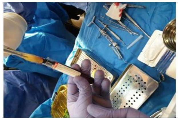
Figure 3. L-PRF clot was removed from the tube