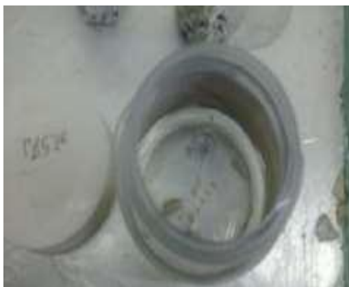
Figure 2- Submission of a small and traumatized sample