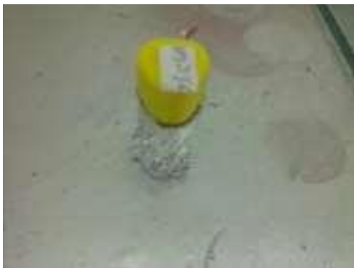
Figure 1- An unsuitable biopsy container