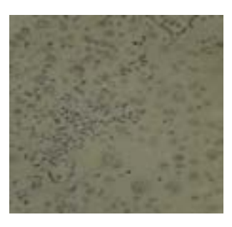
Figure 4: Expression of bcl-2 marker in oral squamous cell carcinoma (OSCC) at 400× magnification

Figure 3: Expression of bcl-2 marker in oral lichen planus (OLP) at 200× magnification