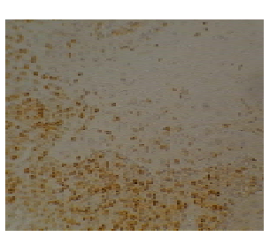
Figure 3: Expression of bcl-2 marker in oral lichen planus (OLP) at 200× magnification