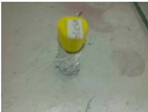
Figure 1- An unsuitable biopsy container