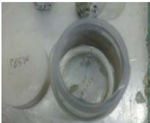
Figure 2- Submission of a small and traumatized sample