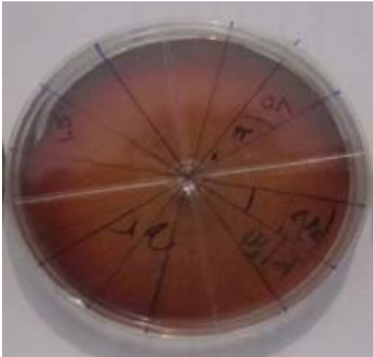
Figure 2. Calculation of the colony-forming units per milliliter (CFU/ml).