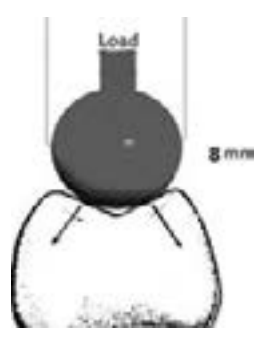
Figure 2. The force was applied by an 8-mm-diameter round metal bar positioned parallel to the long axes of the teeth, in contact with the occlusal slopes of the buccal and lingual cusps.

The specimens were subjected to a compressive force at a crosshead speed of 1 mm/minute. The force was applied by an 8-mm-diameter round metal bar positioned parallel to the long axes of the teeth, in contact with the occlusal slopes of the buccal and lingual cusps (Figure 2).