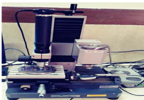
Figure 5. Placement of samples in the Vickers testing machine

Next, the microhardness of the incisal third of the labial surface of the samples was measured using a Vickers hardness tester (V-Test, Baresiss, Germany; Figure 5), and the microhardness values were analyzed and compared using t-test via SPSS version 22 (SPSS Inc., Chicago, IL, USA) with the significance level set at 0.05.