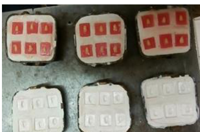
Figure 1. Samples after preparation

The teeth were then mounted in a dental wax block (Cerewax, Istanbul, Turkey), measuring 20×20×6 mm, which was then flaked, subjected to wax burnout, and replaced with heat-cure acrylic resin (Acropars; Marlik, Tehran, Iran). This was done to simulate an actual denture in the clinical setting (Figure 1).