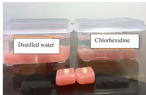
Figure 3. Immersion of samples in the solutions: Chlorhexidine (right) and distilled water (left)

They were removed from the solutions twice daily, each time for 30 seconds, rinsed with distilled water, and placed again in the solutions. This was continued for 120 minutes. (8) The two negative control samples did not undergo any intervention. After the completion of this period, the samples were dried with absorbent papers and stored at room temperature (25±1°C) for 24 hours. They were then thermocycled for 3000 cycles (each cycle lasted for 80 seconds) between 5-55°C with a dwell time of 20 seconds and a transfer time of 20 seconds (Figure 4).