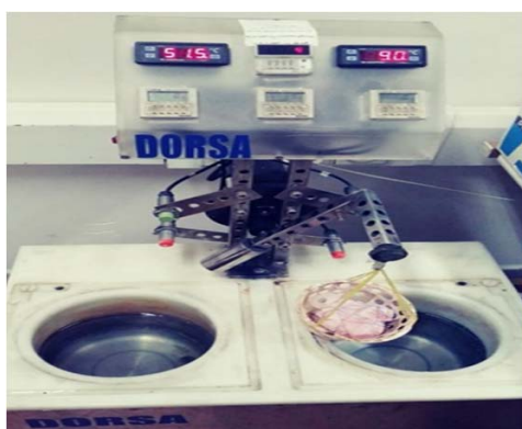
Figure 4. Placement of samples in the thermocycling unit

Next, the microhardness of the incisal third of the labial surface of the samples was measured using a Vickers hardness tester (V-Test, Baresiss, Germany; Figure 5), and the microhardness values were analyzed and compared using t-test via SPSS version 22 (SPSS Inc., Chicago, IL, USA) with the significance level set at 0.05.