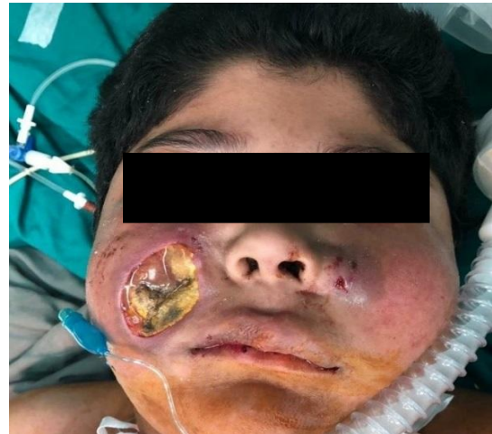
Figure 1. A necrotic ulcer surrounded by edema in the right side of the nose and a developing ulcer with bleeding and edema in the left side

Axial spiral computed tomography with reconstructed coronal and sagittal sections