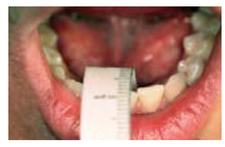
Figure 1: Measurement of salivary flow rate by the modified Schirmer test.

The strip was kept vertically with the help of cotton pliers, while the bottom of the paper was in contact with the floor of the mouth, both on the right and left sides of the lingual frenulum (Fig. 1).<sup>(5)</sup>