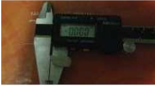
Figure 2- Digital caliper

The caliper was entered into the depth of the defects with a 0.6mm orthodontic wire. For determining the horizontal defects in buccal or lingual surfaces, measurements were done in three different zones: mesio-buccal, mid-buccal and disto-buccal. The deepest level was recorded. (5) For evaluation of bone destructions in the dehiscence of buccal, lingual and interproximal infra-bony lesions, the deepest level was recorded. In fenestrations, we measured the mesio-distal transversal length. For crater defects, the deepest space between the orthodontic wire and the bottom of the crater was measured. If the crater was uneven, the difference between buccal and lingual surfaces was also measured.