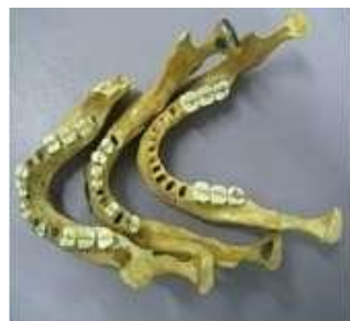
Figure 1-1- dry mandible

ment (n=30), even and uneven craters (n=25), buccal and lingual infra-bony defects (n=17). These defects were formed with 1 and 0.8 fissure burs and ½ and ¼ round burs. (5) (Figure 1)