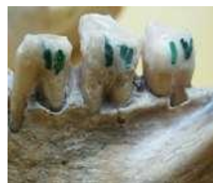
Figure 1-3- infrabony lesion

In order to signify the occlusion surface, an orthodontic wire was used as a marker. For all the lesions, the orthodontic wire was a reference point except for the horizontal lesions, which the reference point was set at the CEJ. The measurements in this study were performed with a modified digital caliper. (Figure 2)