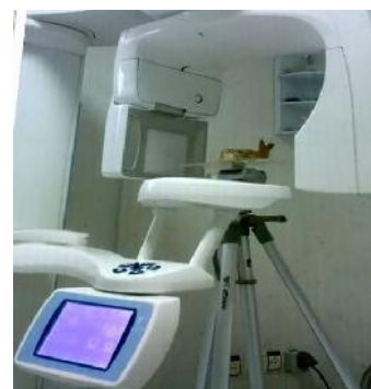
Figure 4-CBCT unit