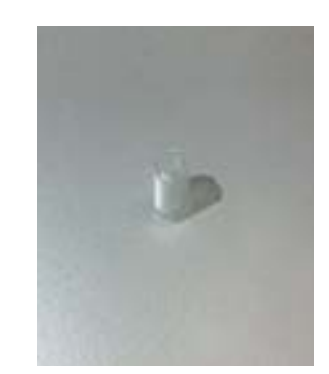
Figure 1. Polyetheretherketone (PEEK) mold

Both glass ionomers were encapsulated. In total, 120 specimens were prepared (40 specimens from each material). These specimens were fabricated using a cylindrical polyetheretherketone (PEEK) mold with a diameter of 4 mm and a height of 6 mm from plastic caps of 27G syringes (Figure 1).