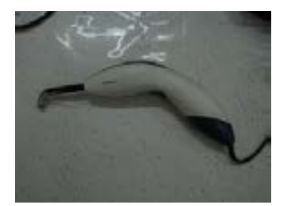
Figure 4. Bluephase light-curing device

As for the composite, the same light-cure device (Bluephase C8, Ivoclar Vivadent, Schaan, Liechtenstein) was used for all specimens (1200 mW/cm2) (Figure 4).