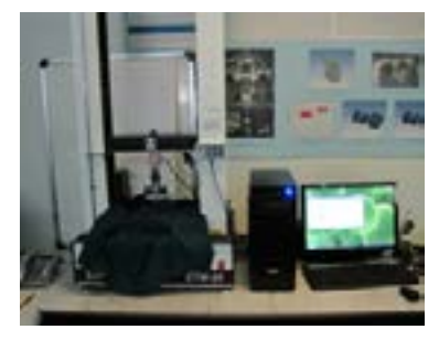
Figure 7. Santam-20 universal testing machine

Statistical analysis was performed using one-way analysis of variance (ANOVA) followed by Tukey's test for intergroup analysis.