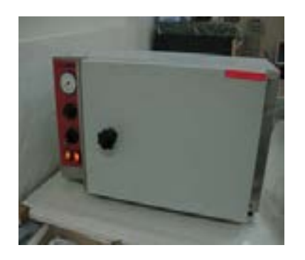
Figure 5. The incubator

The samples were then stored in deionized water at 37^{\circ} C with 95\pm5\% humidity for 24 hours (Figure 5).