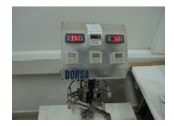
Figure 6. Termocycling machine (Dorsa, Tehran, Iran)

The specimens made from each material (n=40) were then randomly assigned to two groups, one of which would undergo aging while the other was tested for compressive strength without any additional step. During the aging process, using a thermocycler (Dorsa apparatus, Tehran, Iran) (Figure 6), the samples were alternatively immersed in water baths of 5°C and 55°C. The dwell time in each water bath was 15 seconds with a transfer time of 10 seconds for 1000 cycles.