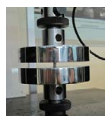
Figure 8. A specimen in the universal testing machine