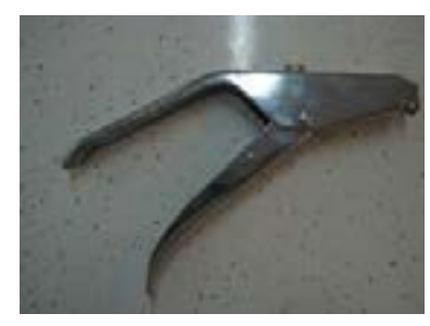
Figure 3. The GC applicator

according to the manufacturer's instructions for each respective glass ionomer and then transferred to the molds using their respective applicators (Figure 3).