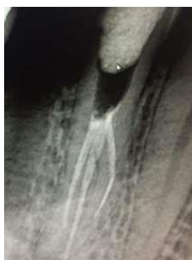
Figure 4. Obturation radiography

Debridement and shaping of the root canals were carried out by the RaCe™ rotary file system (FKG, La Chaux-de-Fonds, Switzerland) with copious irrigation by 5% sodium hypochlorite solution. After the completion of the cleaning and shaping, the root canal system was obturated by using the cold lateral compaction technique with gutta-percha cones and a resin-based sealer (Fig. 4).