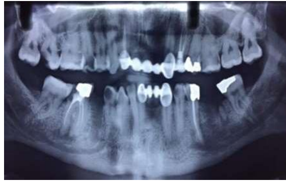
Figure 1- Panoramic radiograph

A 27-year-old man, with no significant medical history, was referred to the endodontics department of Mazandaran University of Medical Sciences, with a chief complaint of a moderate pain in the right lower jaw. There was an intermittent localized moderate dull pain that was initiated by eating sweet and hot foods. On the clinical examination, the patient's level of oral hygiene was found to be moderate. A deep carious lesion was observed in tooth #28, but there were no swellings or sinus tracts. Pulp vitality tests showed sensitivity to hot and cold stimuli and to the electric pulp test. The diagnostic radiograph showed a carious coronal lesion and a sudden narrowing of the root canal according to the "fast break" guideline (Fig. 1). Based on these findings, the pulp was diagnosed with irreversible pulpitis with normal periapical tissues.