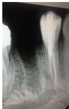
Figure 5. Radiograph of the tooth with coronal restoration

A post-obturation radiograph was obtained, and the coronal access cavity was restored by composite build-up (Fig. 5 and 6).