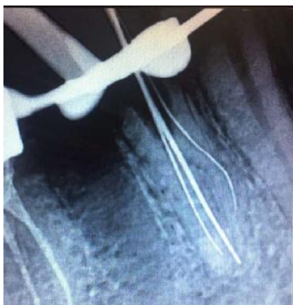
Figure 3. Working length (WL) radiography

The working length (WL) was determined by the use of an electronic apex locator and was confirmed by radiography (Fig. 3).