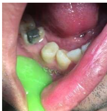
Figure 6. Coronal restoration