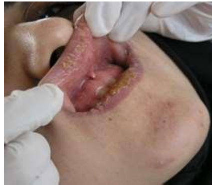
Figure 1- The ulcers on the upper and lower lips and gums with snail tract view.

department of Mashhad Dental Clinic. Extra-oral examination revealed chronic, multiple, yellow-white, crusted ulcers and vegetation predominantly involving the lips. The lesions on the lips were asymptomatic, located on an erythematous base, and had the characteristic appearance of "snail-tracks". The lesions were present since 3 months previously. In addition, intra-oral examination showed small painless lesions on the palate, buccal and labial attached gingivae, alveolar mucosa and vestibule. (Figure1)