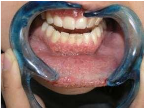
Figure 2a- The ulcers on the lower vestibule and gums with cobblestone appearance, two months after postpartum.

the upper and lower lips, gums and palate. (Figure 2 a, b)