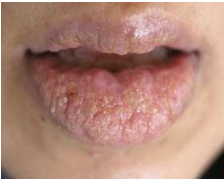
Figure 2b- The ulcers on the upper and lower lips with cobblestone appearance, two months after postpartum.

GI symptoms were also present. These symptoms indicated the progression of the disease. Laboratory investigations showed increase in neutrophil and eosinophil count. Incisional biopsy of buccal mucosal lesions was performed by an oral medicine specialist. In histopathological examination, acanthotic and parakeratotic epithelium with intraepithelial clefts was observed. Inflammatory cells such as eosinophil and polymorphonuclear (PMN) leukocytes were profoundly present in the clefts and diffusely in the epithelium. Blood vessels, collagen fibers and in-depth muscle and fat tissues were also observable. (Figure 3)