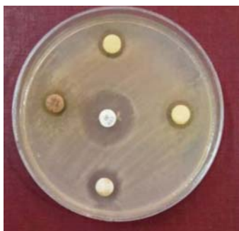
Figure 1- Inhibitory zone assessment

Hinton Agar medium (MHA, Q-Lab, Quebec, Canada) by following the recommendations of Clinical & Laboratory Standards Institute (CLSI). (11) The bacteria were taken from the 0.5 McFarland's standard suspension with the use of a sterile swab and were lawn cultured on MHA medium. In total, 5 disks were located on MHA medium containing Chlorhexidine 0.12% and Chlorhexidine 0.2% (Hexodine, Tehran, Iran) as the witness group (12) , Licorice aqueous extract (made in the pharmacognosy laboratory of the faculty of Pharmaceutical Sciences and Nutrition, Ferdowsi University of Mashhad) as the case group, Licorice alcoholic extract (Iran Dineh, Pharmaceutical Industries Complex) and a blank disk as the control group. The culture medium was then placed inside a GasPak jar anaerobically and was incubated in N-Biotek incubator (NB-203L, Gyeonggi-do, South Korea) at 37°C for 24 hours. (13) After 24 hours, bacterial growth inhibition zone was measured with a millimeter ruler in each of the 5 disks while changes less than 1mm were considered as zero (Fig. 1).