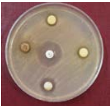
Figure 1- Inhibitory zone assessment

Hinton Agar medium (MHA, Q-Lab, Quebec, Canada) by following the recommendations of Clinical & Laboratory Standards Institute (CLSI). (11) The bacteria were taken from the 0.5 McFarland's standard suspension with the use of a sterile swab and were lawn cultured on MHA medium. In total, 5 disks were located on MHA medium containing Chlorhexidine 0.12% and Chlorhexidine 0.2% (Hexodine, Tehran, Iran) as the witness group (12) , Licorice aqueous extract (made in the pharmacognosy laboratory of the faculty of Pharmaceutical Sciences and Nutrition, Ferdowsi University of Mashhad) as the case group, Licorice alcoholic extract (Iran Dineh, Pharmaceutical Industries Complex) and a blank disk as the control group. The culture medium was then placed inside a GasPak jar anaerobically and was incubated in N-Biotek incubator (NB-203L, Gyeonggi-do, South Korea) at 37°C for 24 hours. (13) After 24 hours, bacterial growth inhibition zone was measured with a millimeter ruler in each of the 5 disks while changes less than 1mm were considered as zero (Fig. 1).